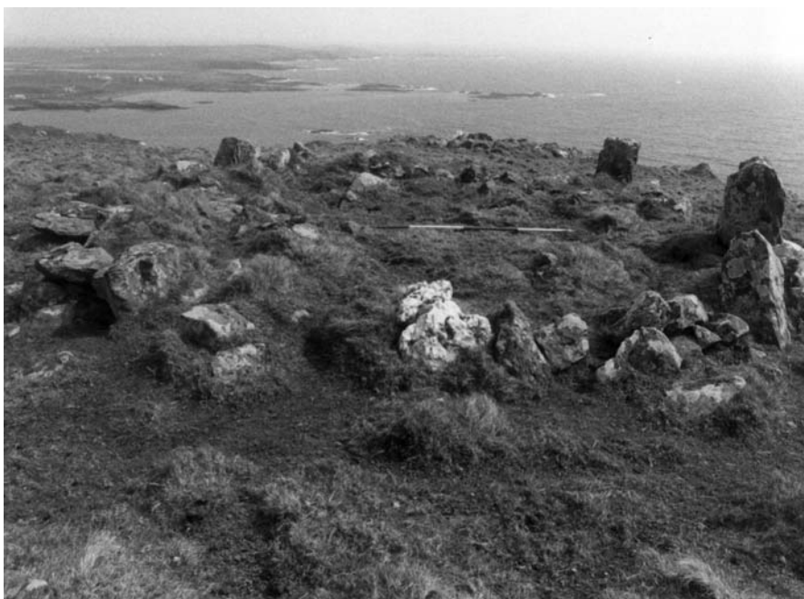
Illus 4 The house prior to excavation, viewed from the north. Scale 2m

Prior to the removal of turf and topsoil, topographic and contour surveys were undertaken on the site. The resulting drawing shows the relationship between the house and enclosure dyke, and the location of the three excavation trenches (Illus 3). Trench A contained the remains of the house. Trench B was placed over the junction of the D-shaped structure with the enclosure dyke to test their relationship. A test pit was dug through the peat in the south-east corner of this trench.