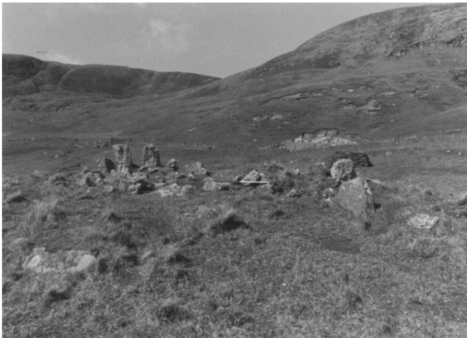
Illus 2 The house in its setting, viewed from the south-east. Scale 1m

It was also proposed to examine the enclosure surrounding the house and any other structures or features contained within it. These included the planticrub , which was located within the footprint of the house, and a D-shaped structure at the north end of the enclosure. The form and function of these ancillary structures were also to be investigated, as were any other areas outside the house enclosure threatened by the proposed quarry. Other implicit aims of the project were to explore the relationship of the house with the quarry, and to place it in the chronological sequence of Shetland's other prehistoric houses.