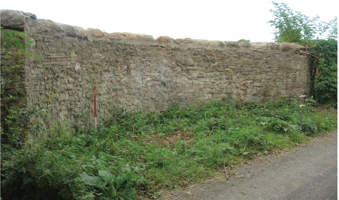
Illus 9.4 (above) Curving feature in the western perimeter wall