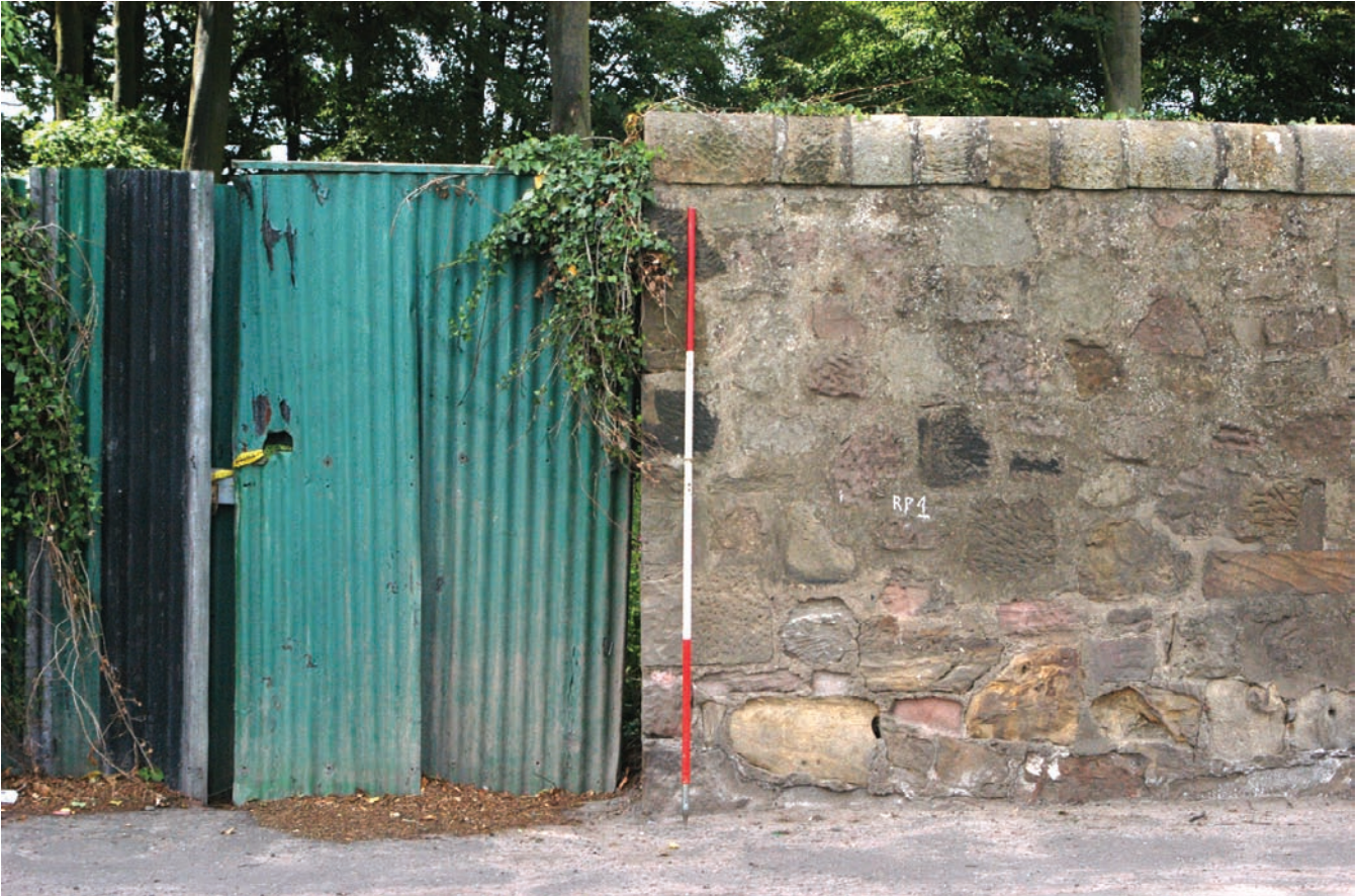
Illus 9.2 Disused entrance in the eastern perimeter wall (recording point 1)

boundary skirts agricultural land and faces the Edinburgh City Bypass. The park wall is a Grade B-listed structure and of historical interest as it is part of the 18th-century layout of the park's designed landscape (Peter McGowan Associates 2005).