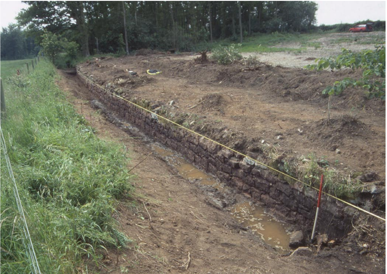
Illus 9.7 General view of the Castlesteads boundary