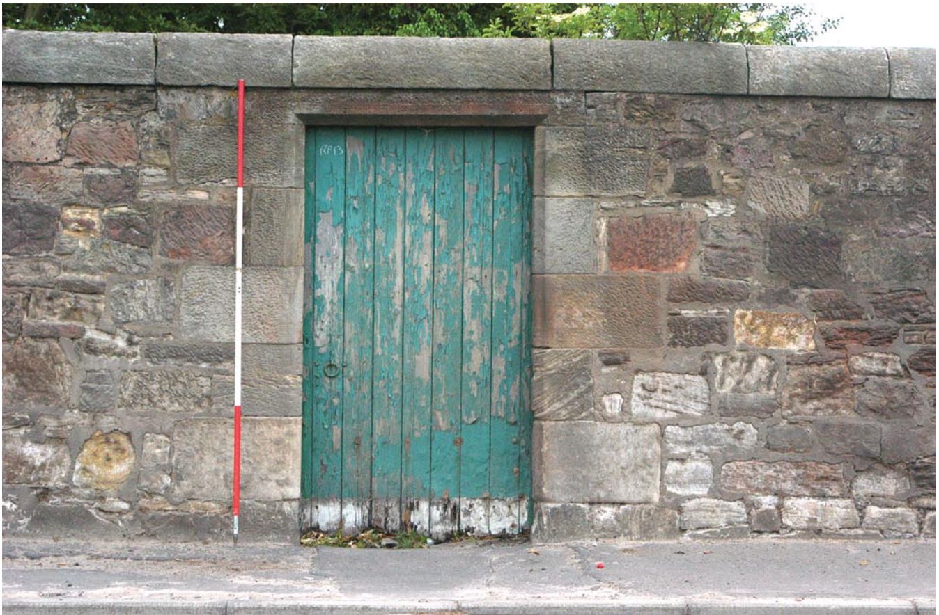
Illus 9.3 Disused doorway in the eastern perimeter wall (recording point 13)

mortar. The coping stones were hewn semi-circular blocks 0.4m wide. The ground on the park side of the wall is lower, giving rise to higher elevations (mean 3m) on this side of the wall in comparison with the roadside, against which the wall is more uniform, with an average height of 2.3m. A gateway and two door openings were the only features of architectural interest ( illus 9.2–9.3 ), and these were designed to provide easier access to Salter's Road, the nearest formal access being Smeaton Gate, some 200m to the north towards the village of Whitecraig. The doors are 20th-century in date but the moulded surrounds are original 18th-century features with chamfered ashlar mouldings and droved margins on the quoins.