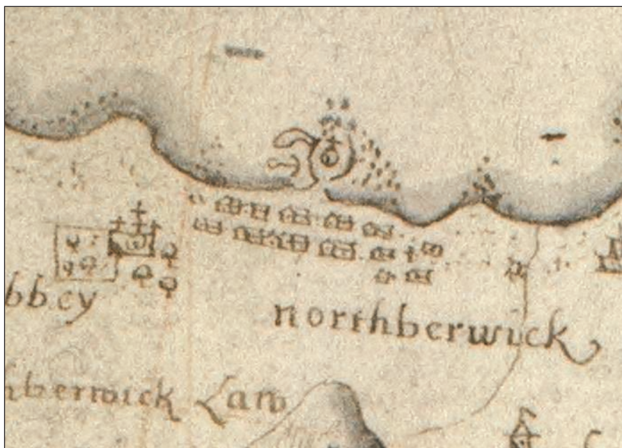
Illus 4 Adair’s map

Adair’s map also suggests that the north–south street (such as it exists on this early manuscript version) does not line up with the harbour and church. The layout is repeated in the more formalised printed version published in 1736. None of the later maps of North Berwick show this arrangement, and it is more than likely that it is merely a schematic representation.