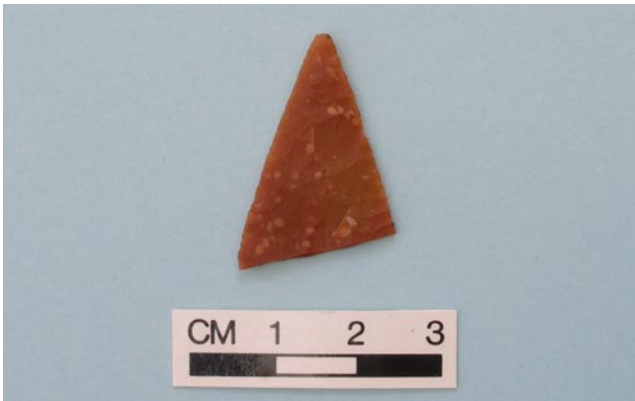
Illus 68 Tip of leaf-shaped arrowhead SF100

the serration was formed through retouch or edge damage, as it is very crude (SFs 108, 138, 186a).