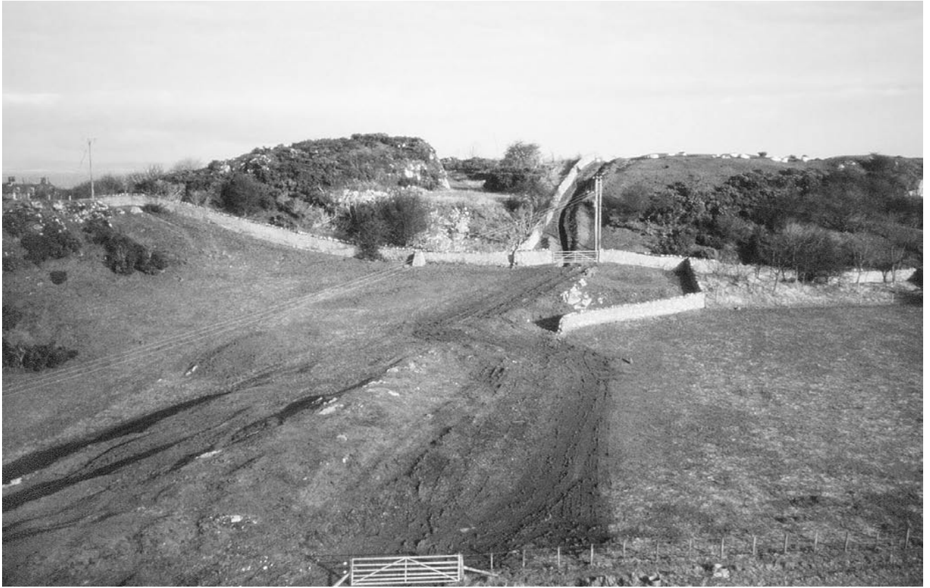
Plate 1 The view from the parapet of Fenton Tower showing the Common on the horizon, with the water pipe trench adjacent to the field wall and the quarry on the left