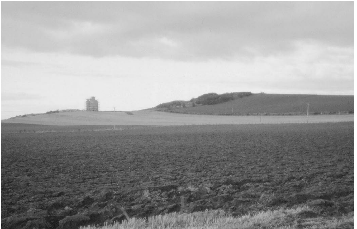
Plate 2 Kingston Common and Fenton Tower, from near Rockwell Farm