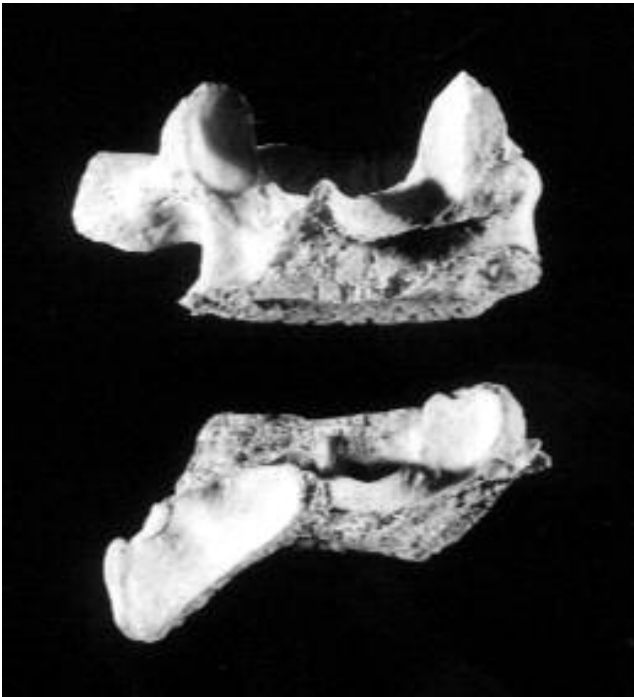
Plate 31. Hornish Point. Human vertebrae from the burial showing evidence of cutting

skeletons (Brothwell & Powers 1968). The spinal cord is usually normal and lies within its bony canal. The membranes are intact but the spinous processes and laminae of one or more vertebrae are defective, in life these would have been bridged by cartilage or membrane. In this individual the defect occurs in the first three sacral vertebrae. In most cases (and almost certainly here) it would not have given rise to symptoms, although in more severe cases it may be associated with paralytic deformities of the lower limb (Illingworth & Dick 1979). The dentition is normal and healthy with slight calculus on the labial surfaces.