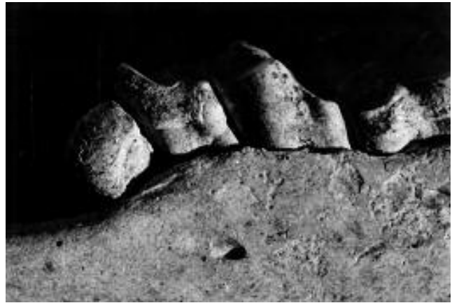
Plate 32. Sheep mandible showing a heavy development of calculus

The concentration of cattle mortality in the very young and old age groups – a far from 'gourmet' strategy of husbandry – is consistent with, though hardly indicative of low status. At