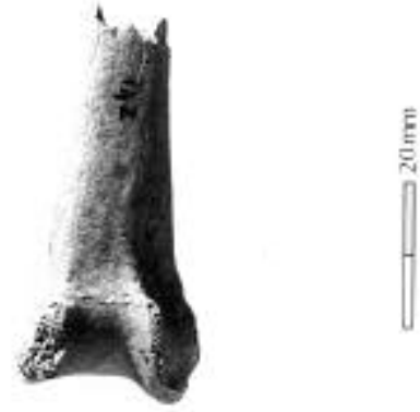
Plate 33. Baleshare. Distal tibia of extinct crane species from Block 16