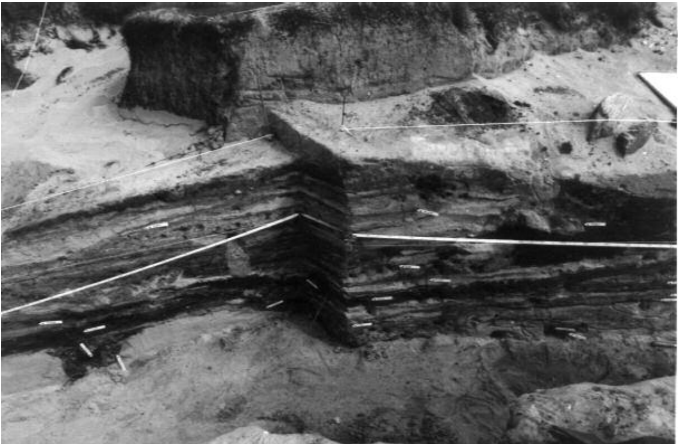
Plate 29. Newtonferry. The midden deposits of Block 3