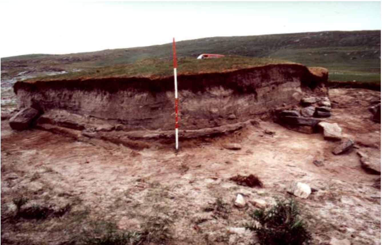
Plate 28. The tallard at Newtonferry after deflation material has been removed from the surrounding surface. Masonry of Block 1 is visible at the base of the tallard