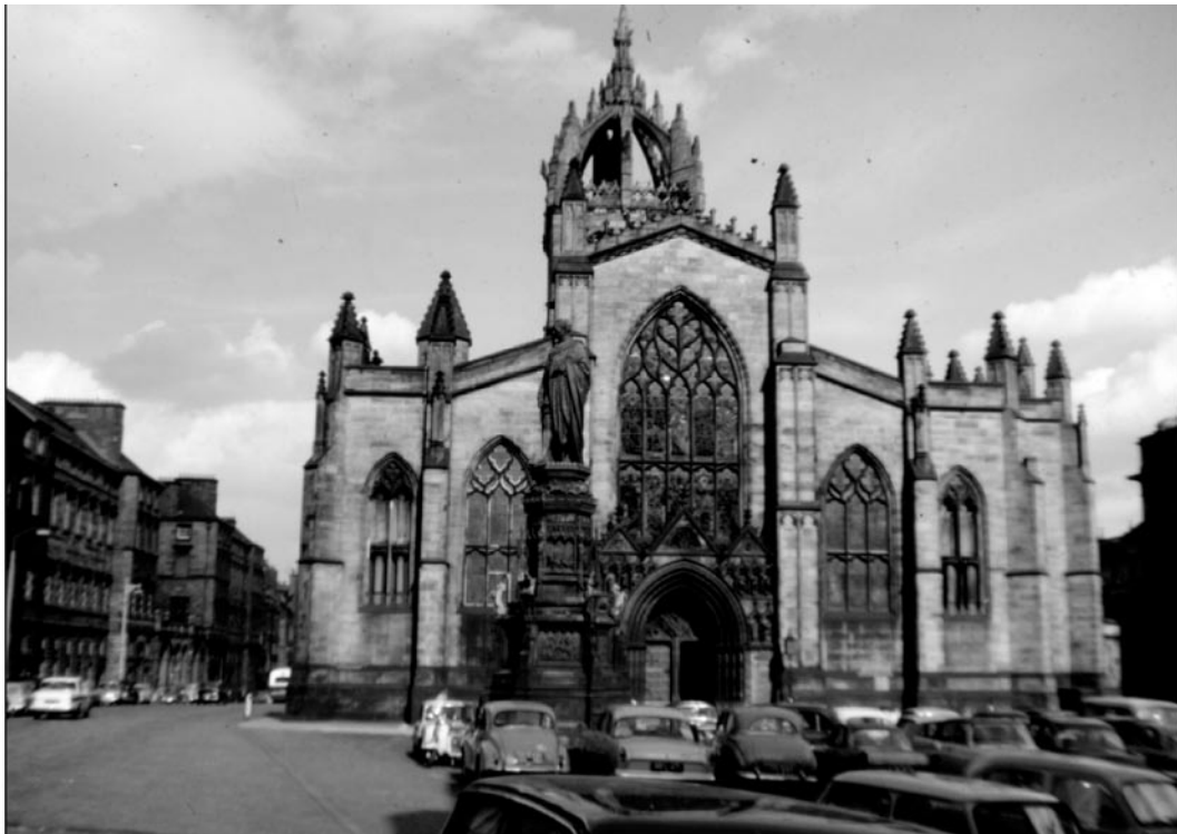
Illus 2 St Giles' Cathedral, Edinburgh, from the east