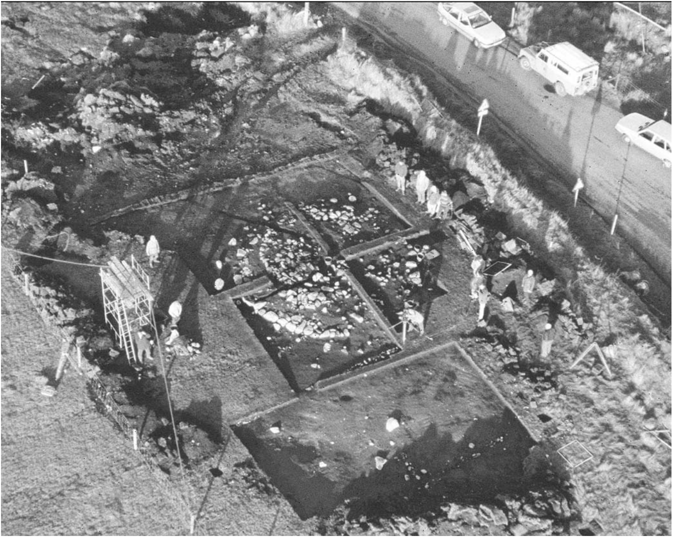
Illus 2 The cairn from the south-west

Illus 1 (opposite) Location maps (based on the Ordnance Survey – Crown copyright). Key: 1: Kerbed cairn (NB23 NW8) – Curtis & Curtis 1991a ; 2: Probable kerbed cairn (NB13 NE12) – Curtis & Curtis 1991b ; 3: Possible burial cairn (NB13 SE15) – Curtis & Curtis 1991c ; 4: Possible burial cairn (NB13 SE16) – Curtis & Curtis 1991d ; 5: Possible kerbed cairn (NB22 NW5) – Curtis & Curtis 1991e ; 6: Possible kerbed cairn (NB13 SE20) – Curtis & Curtis 1992a ; 7: Possible kerbed cairn (NB13 SE21) – Curtis & Curtis 1992b ; 8: Possible kerbed cairn and possible burial cairn (NB22 NW6) – Curtis & Curtis 1992c ; 9: Possible burial cairn (NB23 NW11) – Curtis & Curtis 1992d ; 10: Possible burial cairn (NB32 NW4) – Curtis & Curtis 1992e ; 11: Burial cairn (NB13 NE13) – Curtis & Curtis 1994 ; 12: Possible burial cairn (NB23 SW66) – Curtis & Curtis 1997 ; 13: Possible kerbed cairn (NB13 SE14) – Curtis & Curtis 1990a ; 14: Chambered cairn (NB23 NW1) – Henshall 1972, 460 ; 15: Two kerbed cairns (NB23 NW3) – Curtis & Curtis 1995 ; 16: Possible burial cairn (NB13 NE8) – Curtis & Curtis 1990b ; 17: Kerbed cairn (NB13 SE13) – Curtis & Curtis 1990c ; 18: Kerbed cairn on Cnoc an Tursa – Campbell & Coles 1999 ; 19: Burial cairn (NB23 SW4) – Ponting et al. 1976 . Roman numerals – Standing stones and circles: numbers follow those on the map of standing stones and circles at Callanish (University of Glasgow, Department of Geography 1978)