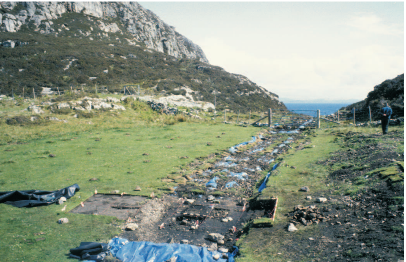
Illus 6 Camas Daraich: view across and up the raised beach from the N