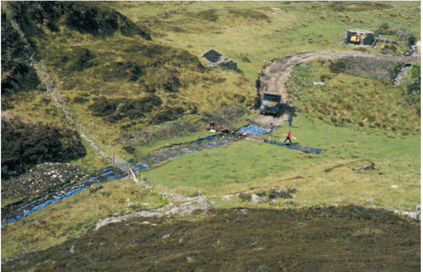
Illus 5 Camas Daraich: general photograph of the site from the SE, showing the grass-covered raised beach with the track running across it and excavation in progress on trench 1