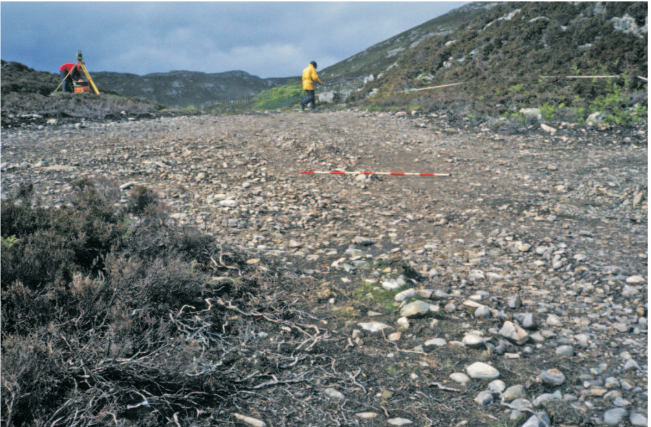
Illus 7 Camas Daraich: view of the surface of the raised beach at its crest above the site, from the S