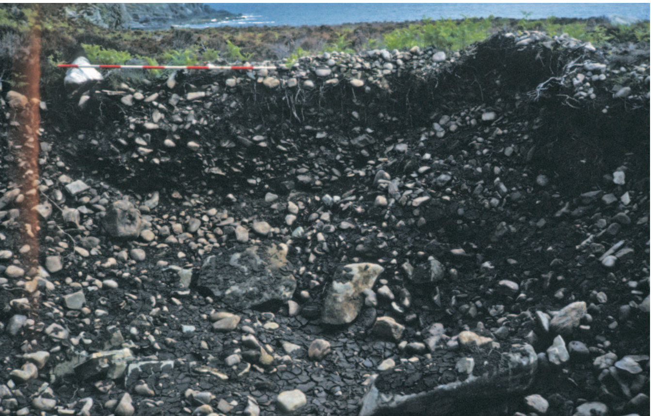
Illus 8 Camas Daraich: barrow pit cut into the raised beach above the site